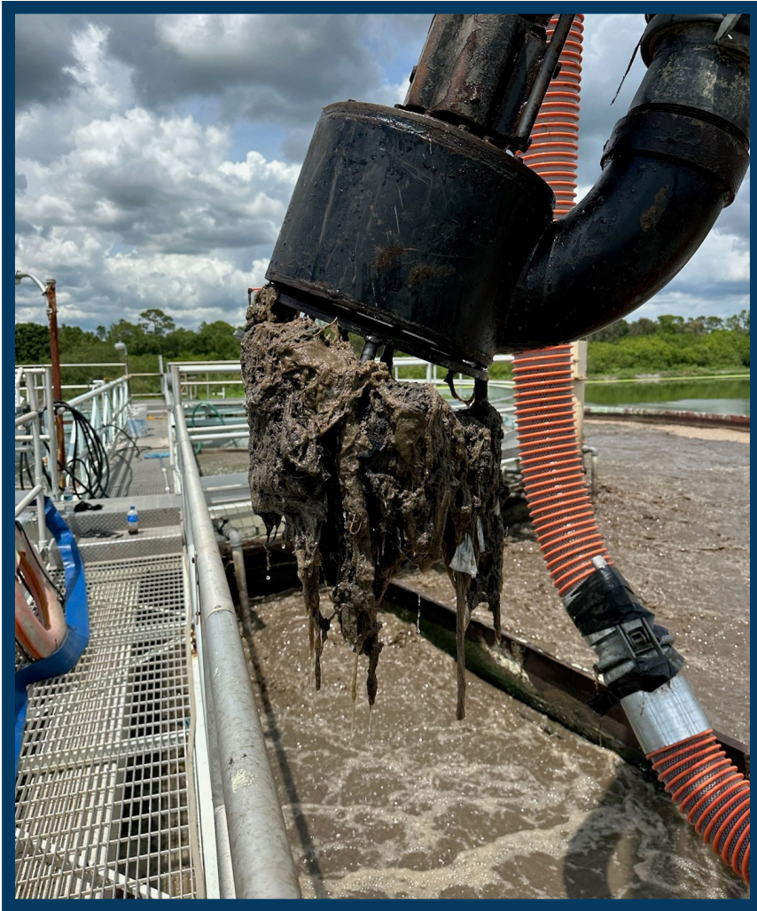
Grit Removal Process